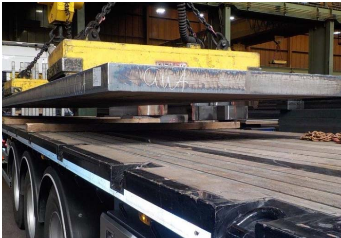
Picture 3: Immediate availability of material from stock and clearly defined process flows enable Jebens to have extremely short lead times for the plates urgently needed for maritime salvage.