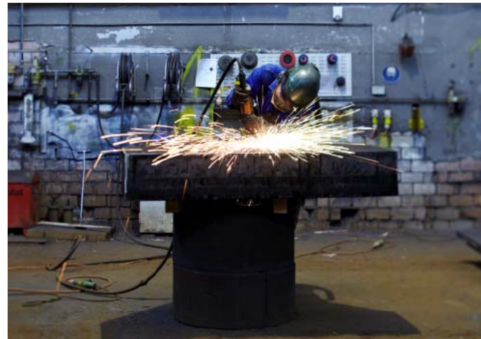
Picture 4: Within a very short time, Jebens supplied two flame-cut plates including perforations for the suspension of the plates and polishing for the salvage specialist Koole Contractors.