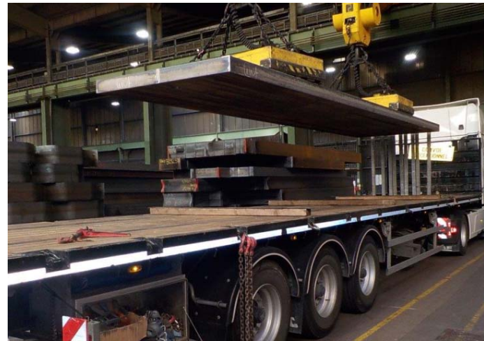
Picture 2: Within two days Jebens had the processed massive steel plates ready for transport.