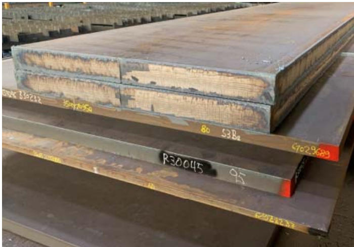
Picture 1: High-speed order for Jebens: two plates – each measuring 7,700 mm long, 1,900 mm wide and 150 mm thick with flame cuts for maritime salvage.

When heavy plate is used as a guillotine