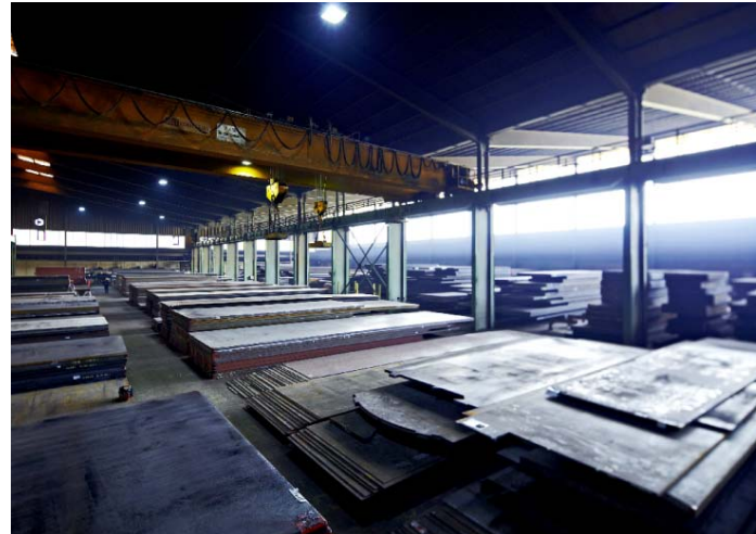
Picture 6: A prerequisite for Jebens' high-speed orders is one of Europe's biggest stocks of large-format heavy plates in thicknesses of 150 mm or more.