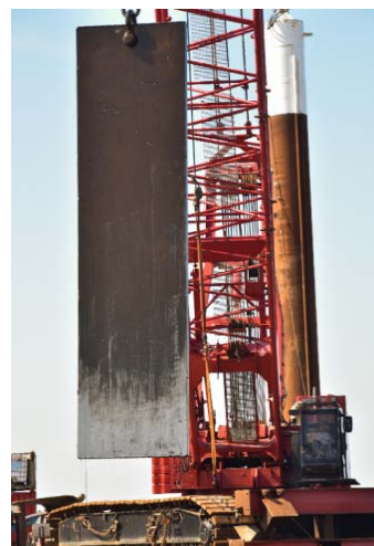
Picture 8: The plate serves as a cutting tool for the segmenting of the shipwrecked vessel.

Picture 5-6:  Picture 7-8: