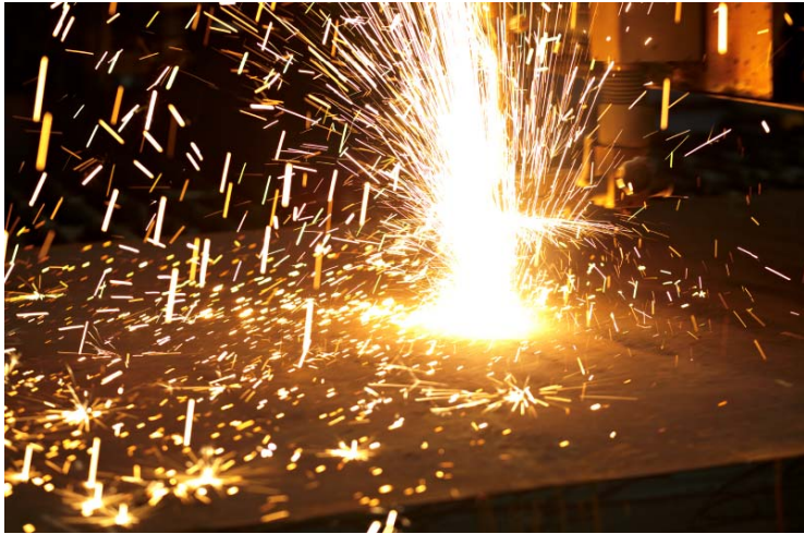
Picture 5: The flame-cutting specialist Jebens processed the plates in the shortest possible time so that they were on site on time.

When heavy plate is used as a guillotine