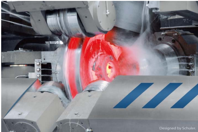
Picture 5: From the pre-forging press, a gantry robot conveys the wheel blanks to the core component of the forging line, the wheel roller.

Precision press line gets railway wheels for high-speed trains into shape