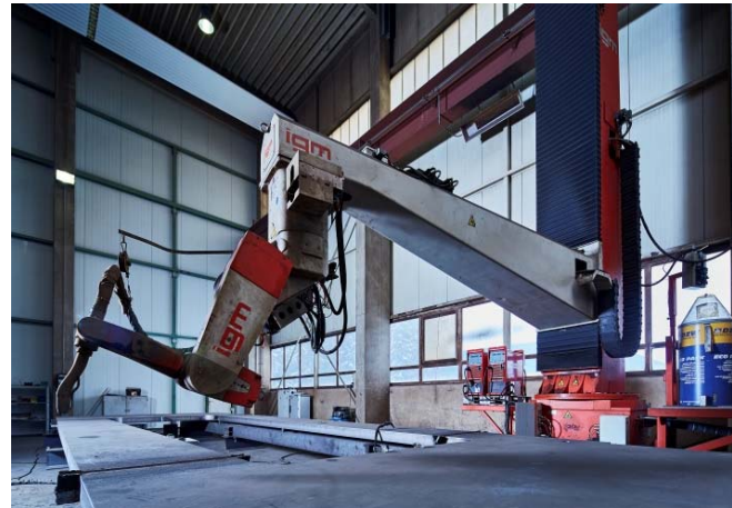
Picture 2: There are not many welding companies capable of fulfilling the correspondingly demanding welding specifications defined by Schuler.