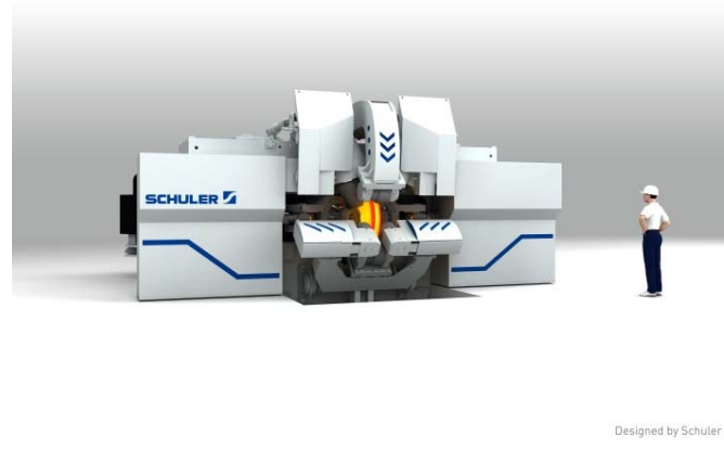
Picture 6: The wheel blanks are forwarded by robot to the pre-forging press, where, in two forming stages, they are forged with a press force of 10,000 tons.