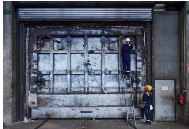
Picture 4: The 15 metre long, 5.8 metre wide and 3.8 metre tall annealing furnace had no problem in accomodating the gigantic dimensions of the large-format components.