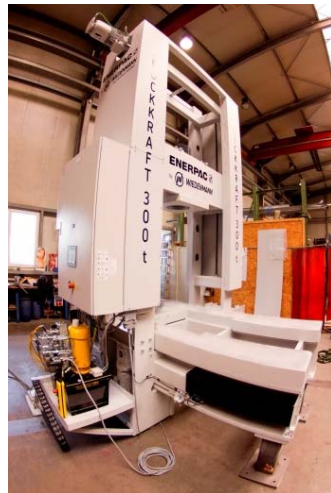
Picture 3+4: For this four metre high and 2.8 metre wide roll frame press with 3,193 kN (300 tonnes) of pressing force, a table length of 3.8 metres and 13 tonnes tare weight, Jebens welded press table and base components of the upper yoke.