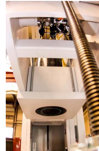
Picture 8: The hydraulic cylinder mounted centrally in the upper yoke locks automatically in the new position.

Picture 6-9: © Wiedenmann-Seile GmbH Picture 10: © Jebens GmbH