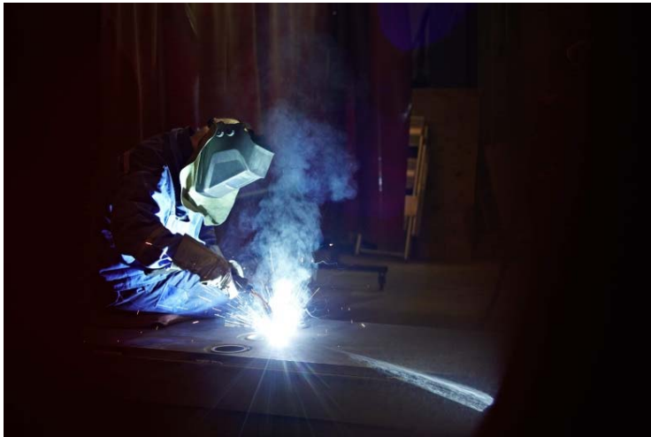
Picture 15-17: The many years of experience of the flame cutting specialists in the challenging precision steel work spoke in favour of Jebens.