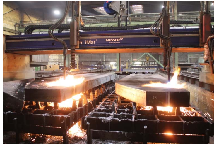
Picture 12: The profiling was performed with several burners operating in parallel.