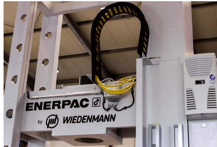
Picture 5: The massive welded and completely electrified roll frame construction is movable along a distance of 1,750 millimetres.