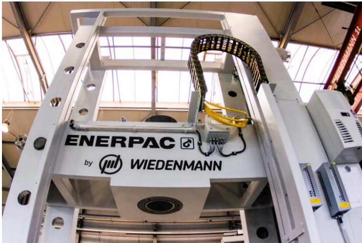
Picture 6: The electronically adjustable upper yoke can be set in five stages of 400 millimetres via a spindle drive and operating panel.