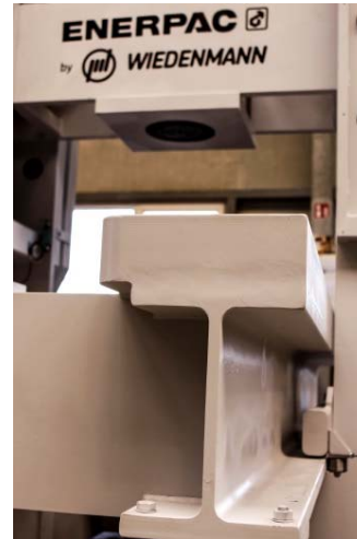
Picture 7: Jebens used S690 QL quality fine-grained steel to ensure the required high pressure load of 3,193 kN.