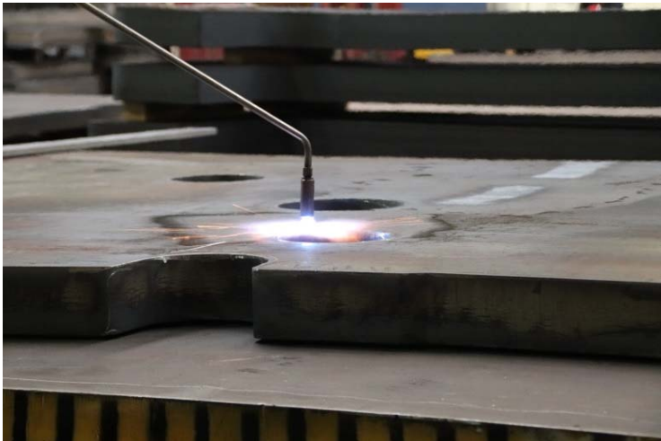
Picture 13+14: For the straightening of the 120-millimetre-thick sheets of the high-strength steel with the flame, the proven expertise of the master aligner at Jebens was needed.