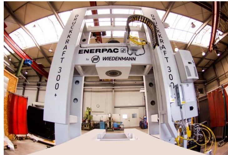
Picture 2: With the press table, eleven different press-table inserts and the base components for the mobile upper yoke, Jebens created the core elements of the base construction for this high-end press.