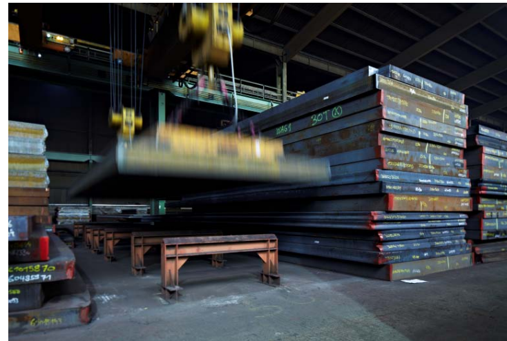
Picture 10: The availability of high-strength steels in their own stock - in thicknesses from 30 to 300 millimetres – spoke in favour of Jebens.