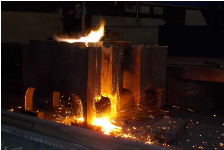
Picture 11: The fine-grained steel was pre-heated to 150 degrees Celsius and parameters such as oxygen pressure and the cutting speed were set accordingly.