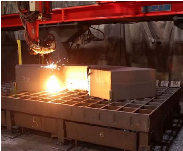
Picture 3: Jebens cut curved flame-cut parts with six different bevels so precisely that these components meet the tightest of tolerances.