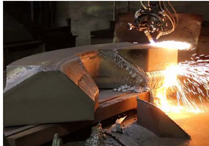
Picture 8: Jebens achieved the extreme contours of the components within three weeks with the required precision.