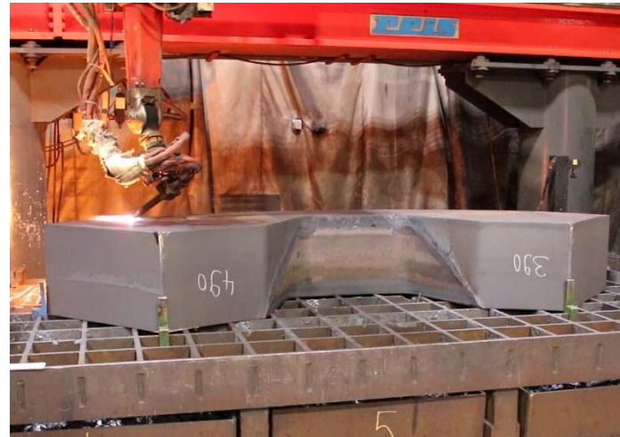
Picture 4: In order to process sheet metal of the thickness S355J2 + N with APZ 3.1, particularly complex and precise temperature control is necessary.