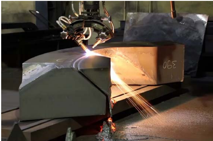
Picture 7: In view of the tight tolerances specified for this sheet thickness, the cutting bevel and quality demanded for these chamfers were a fine art.