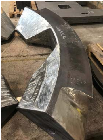
Picture 1: High flame cutting expertise from Jebens in 400-millimetre thickness.